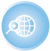
MOTOTRBO Location Services